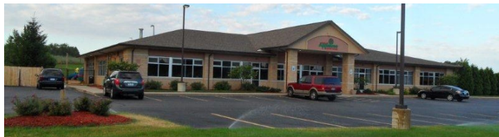
Appletree Learning Center - Rockford, MI