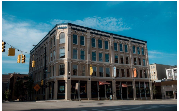
38 W. Fulton Building - Grand Rapids, MI

We at Greemann Capital welcome the opportunity to discuss your financing needs. Call us today for more information...we look forward to hearing from you!