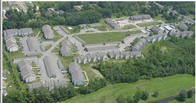
BAYBERRY POINTE APARTMENT COMPLEX

Greemann Capital is proud to announce the recent closing of the Bayberry Pointe Apartment's financing package. Located on the northwest side of Grand Rapids, MI, Bayberry Pointe is a 308 unit apartment complex. The loan amount was $11,650,000 and placed with Freddie Mac with a 10 year term and a 30 year amortization . The LTV was 64% utilizing appraised value.