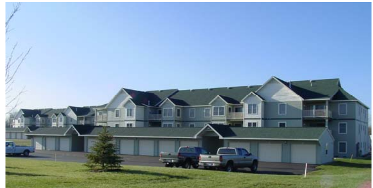
KENSINGTON PRESERVE APARTMENT BUILDING